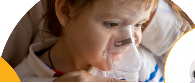
Illustrative image: OMRON CompAIR NE-C28P